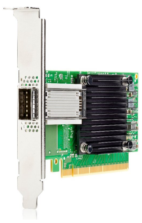
P/N P31246-B21, P31246-H21 (ConnectX®-5 EN)