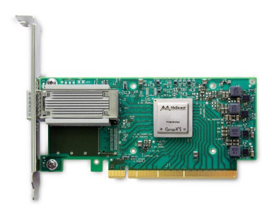
P/N 872725-B21, 872725-H21 (ConnectX®-5)

Combined with EDR InfiniBand Switches or 100Gb Ethernet Switches, they deliver low latency and up to 100Gbps bandwidth, ideal for performance driven server and storage clustering applications in HPC and enterprise data centers.