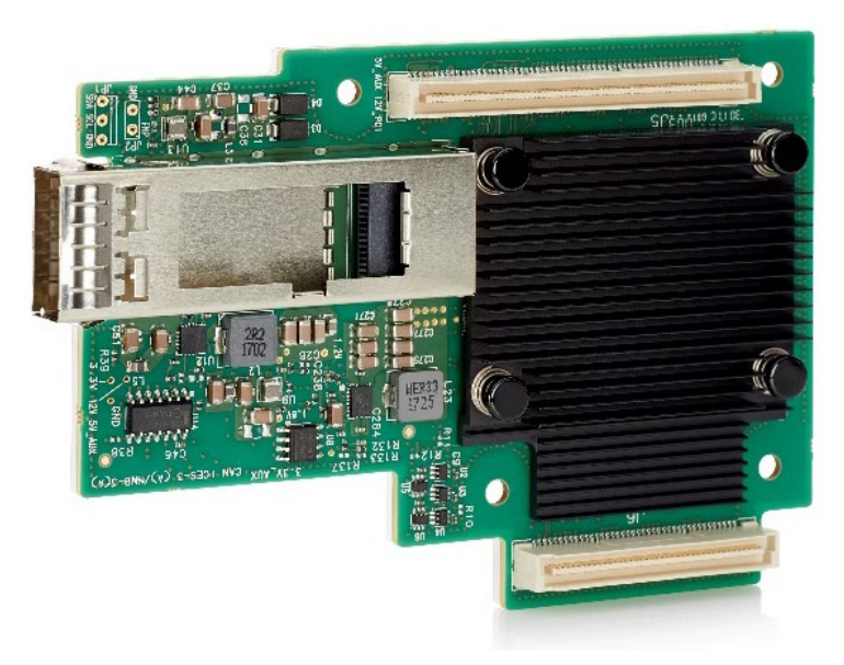
P/N P02012-B21 (ConnectX®-5)