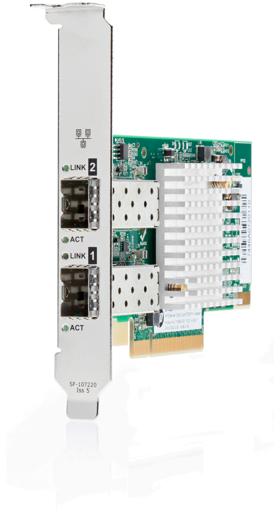
HPE Ethernet 10Gb 2-port 571SFP+ Adapter with the standard bracket

The HPE Ethernet 10Gb 2-port 571SFP+ Adapter based on the Performant SFC9020 controller from Solarflare is designed to address issues facing data center managers today. Equipped to handle the application loads of the latest multi-core processors, the HPE Ethernet 571 adapter also delivers unmatched power efficiency for the consolidation and deployment of high-density servers.